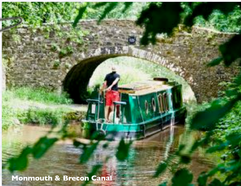
Monmouth & Brecon Canal