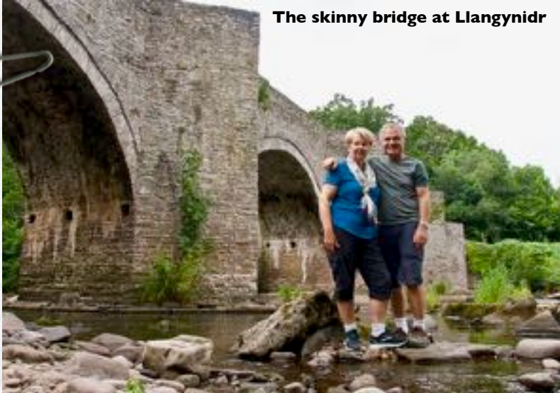
The skinny bridge at Llangynidr