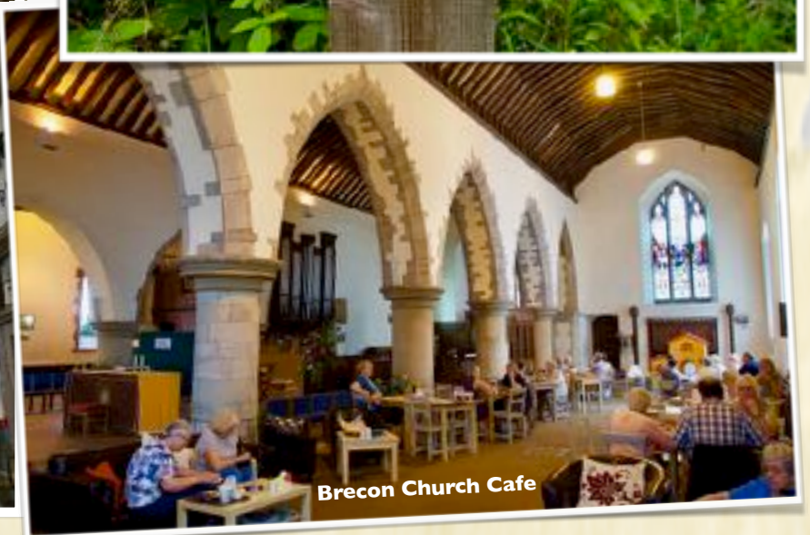
Brecon Church Cafe