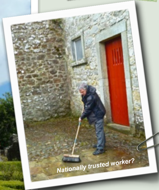
Nationally trusted worker?