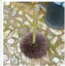
Innovative shoe cleaner

Petrol in both Northern Ireland and the Irish Republic is expensive - around $A2.10 per litre - about the same price as bottled water!