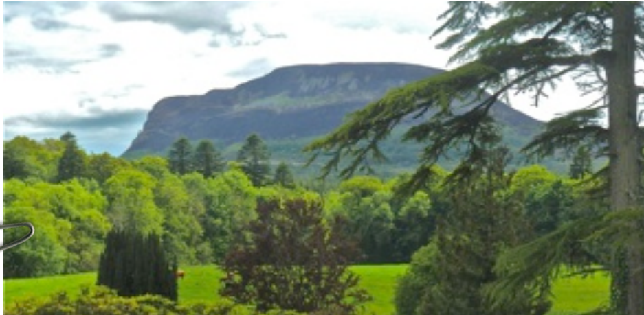
Magnificent scenery alongside Lough Erne