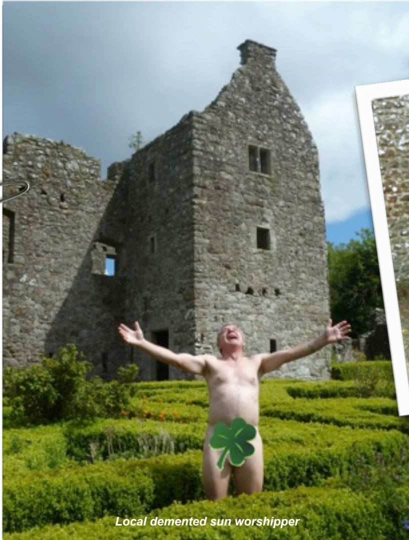
Local demented sun worshipper