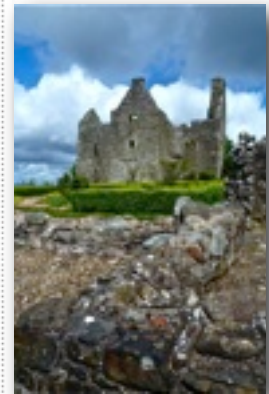
Tully Castle ruins