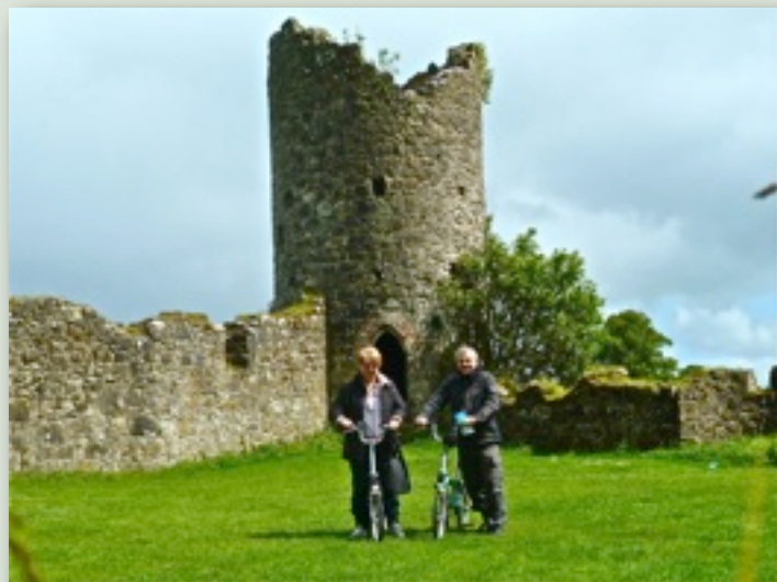
Great to ride again