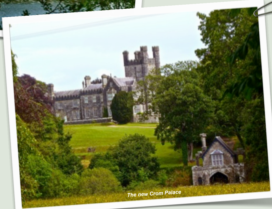
The new Crom Palace