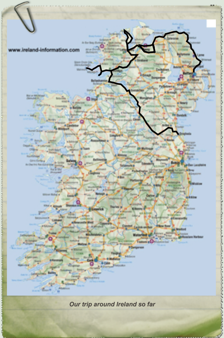
Our trip around Ireland so far

The road along the lake was described as a geographical wonder. The marshlands support a wide diversity of bird life but unfortunately the best views are evidently from a boat which we did not have. We enjoyed the drive through the country however.