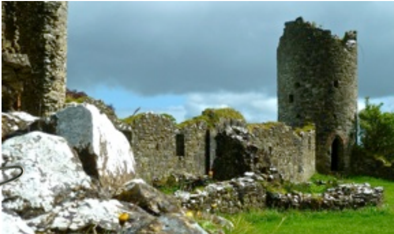
Crom Castle ruins