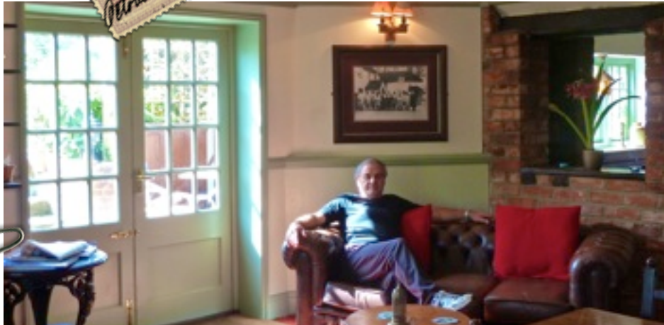
Relaxing in The George, Eartham