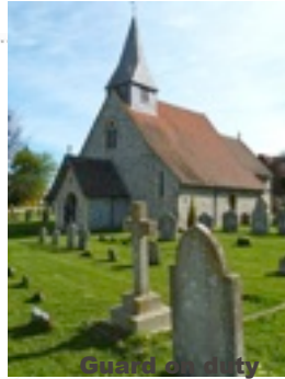
Guard on duty