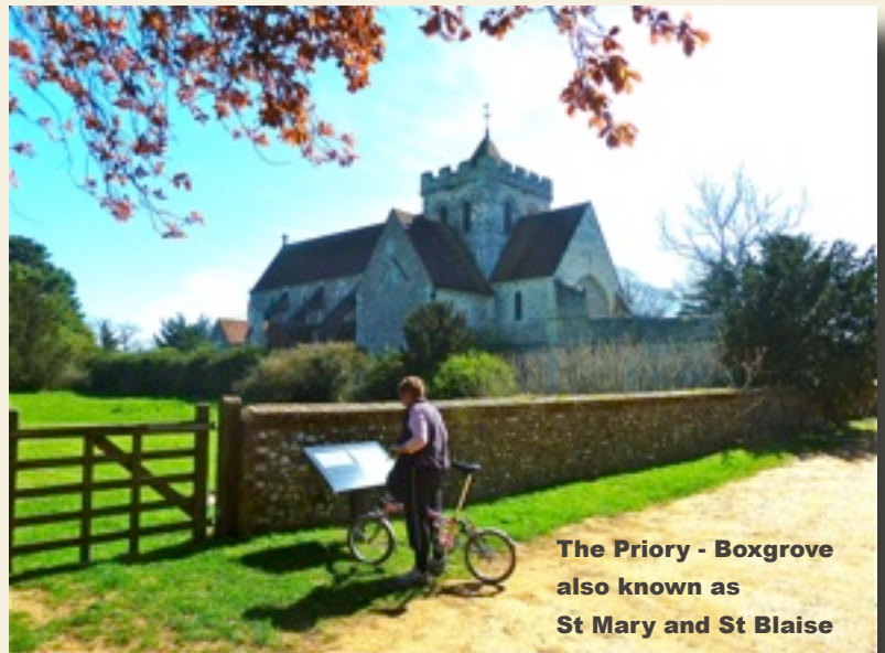
The Priory - Boxgrove also known as St Mary and St Blaise