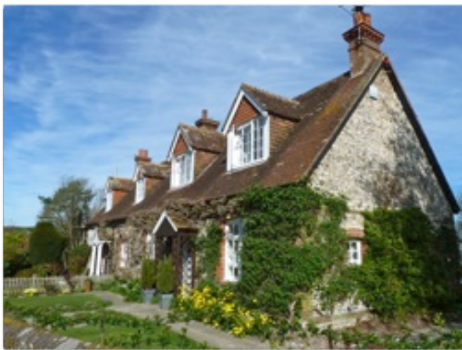
History and Charm - Eartham