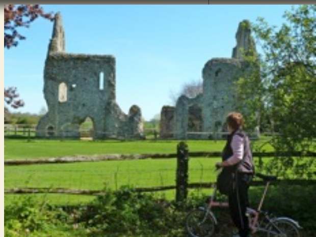
The ruins of Benedictine Monastery - Boxgrove