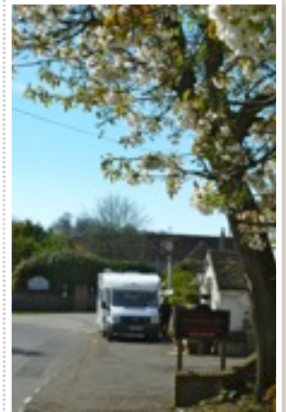
Spending time in Eartham