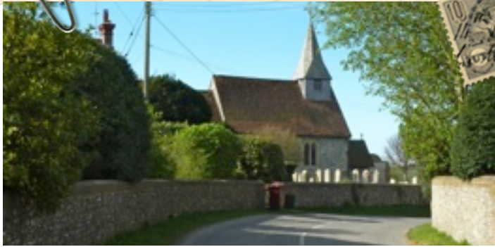
St Margaret's Eartham