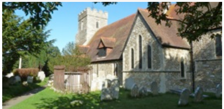
St Stephens's Church - North Mundham

Then it was time to drive as quickly as possible through the big cities of Portsmouth and Southampton and on to Dorset. We are camped in Swanage on the coast near Bournemouth. Tomorrow we intend to visit Frampton, the ancestral home of THE Framptons (son in law).