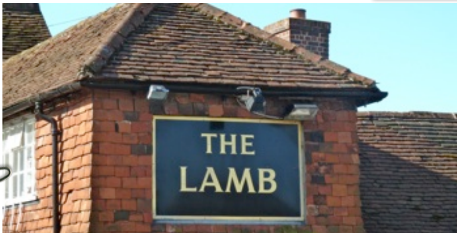
Heather's favourite name.