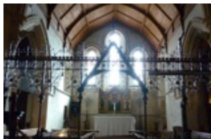
Inside St Stephens