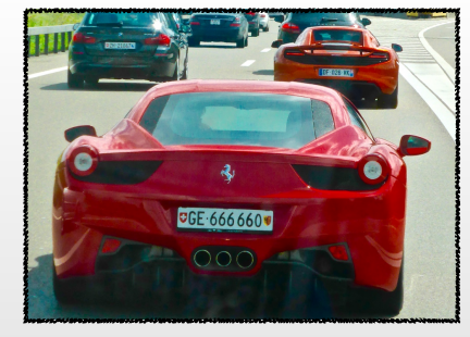
VROOM VEROOM VROOM Not just one but two Fararri's - no sooner did we see them then in a flash they were gone. Mind blowing.

We took our time and stopped for lunch and an afternoon cuppa. We had hoped to stay in a road side overnight parking place. They had been plentiful the whole day - until we decided to choose one and bed down for the night. We gave up eventually and headed for a caravan park at Lindau - a place we stayed 2 years ago. It is a village on Lake Constance. Sig has a very sore leg and is literally incapacitated with it. Luckily he can drive, but walking and bike riding are not on the agenda. He immediately bedded down to rest and I made tea and then went for a great ride beside the lake. Tomorrow we will be with the Smiths in their time-share place on the German - Swiss border.