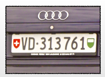
REGISTRATION NUMBERS The Swiss don't believe in short number plates. This was the shortest we have seen. Saw one with 9 numbers today.