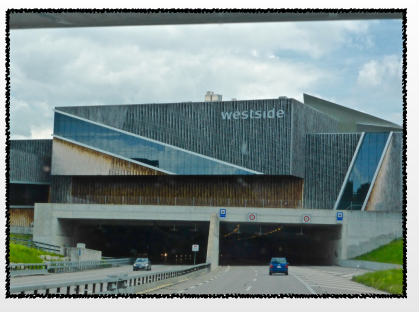
TUNNEL Why waste land? Big factory on top a n d long tunnel underneath. Dual purpose.