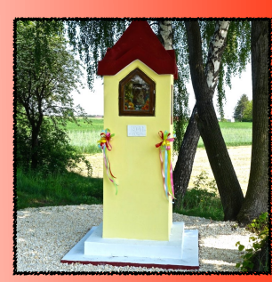
CELEBRATION Everywhere you look you come across a shrine. Even in the most remote places. What's more they are beautifully decorated. Flowers start appearing in May.