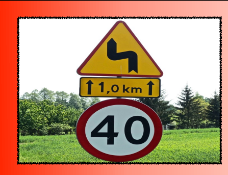
COMMAS Europeans prefer the comma to the full stop. It confuses us. Where we use a full stop they use a comma, and what's worse, it's visa versa too.

Family party time in Poland is measured in hours and the number of shots of vodka that can be consumed within such time is phenomenal. What interests Heather and I is why we do not get tipsy after all that alcohol? Eventually we got to bed and, after a late rise, Heather and I and Waclaw took to our bikes for a long ride around the area. We visited 5 villages and I got totally disorientated. The 20km ride was just the thing we needed because as soon as we got back home it was family party time again. Six more hours of eating and talking.