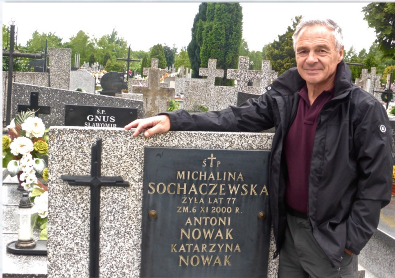
GRANDFATHER ANTONI'S GRAVE