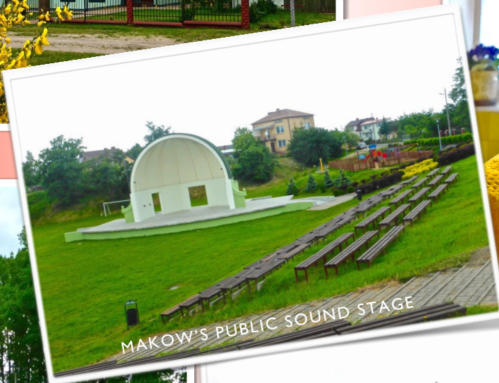
MAKOW'S PUBLIC SOUND STAGE