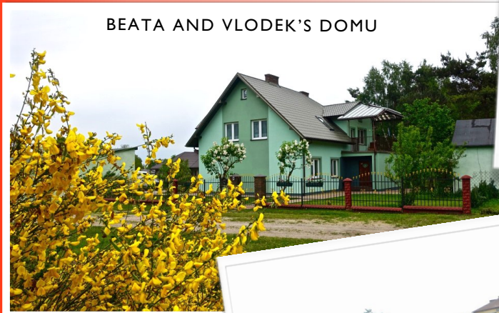
BEATA AND VLODEK'S DOMU