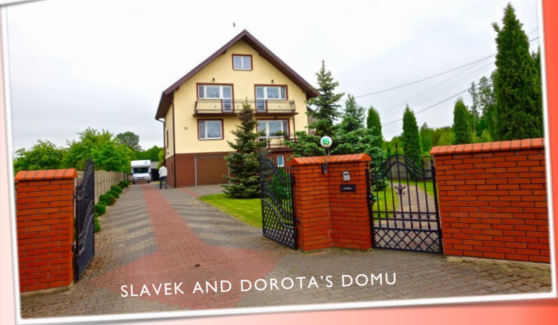
SLAVEK AND DOROTA'S DOMU