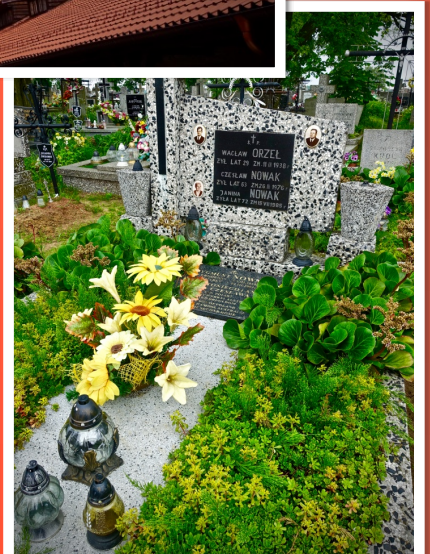
DAD AND HIS BROTHER REUNITED