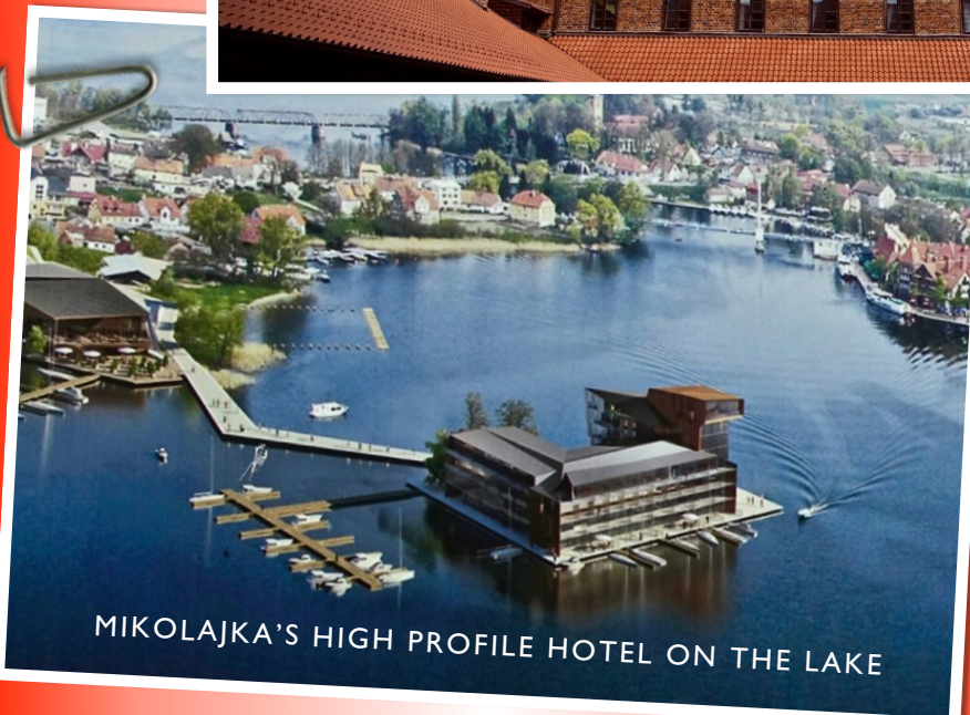
MIKOLAJKA'S HIGH PROFILE HOTEL ON THE LAKE