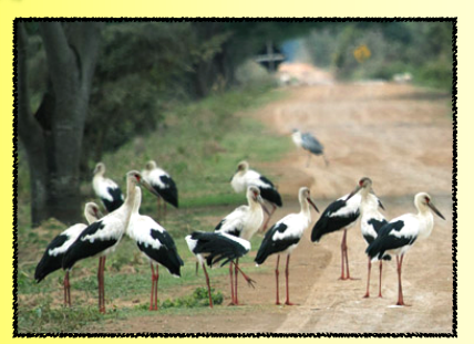
STORKS We have not seen so many storks congregating together as in Lithuania. They are attracted to insects when farmers turn the soil. Their presence apparently signal good luck.

Latvia is about half the size of Tasmania. We only have a few days here. The weather turned foul so instead of heading to the north west coast we opted instead to head to Riga where we are now. Tomorrow we have time to explore the city called the Paris of the North.