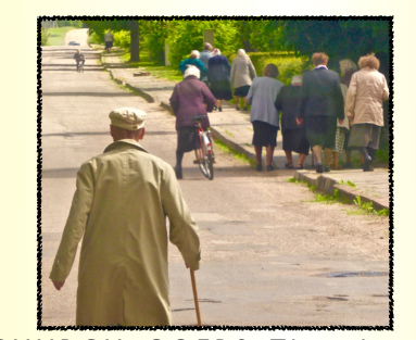
CHURCH GOERS The church congregation moved unsteadily out of the church. Every person in the passing parade was lost in their own thoughts. Must have been some sermon!!