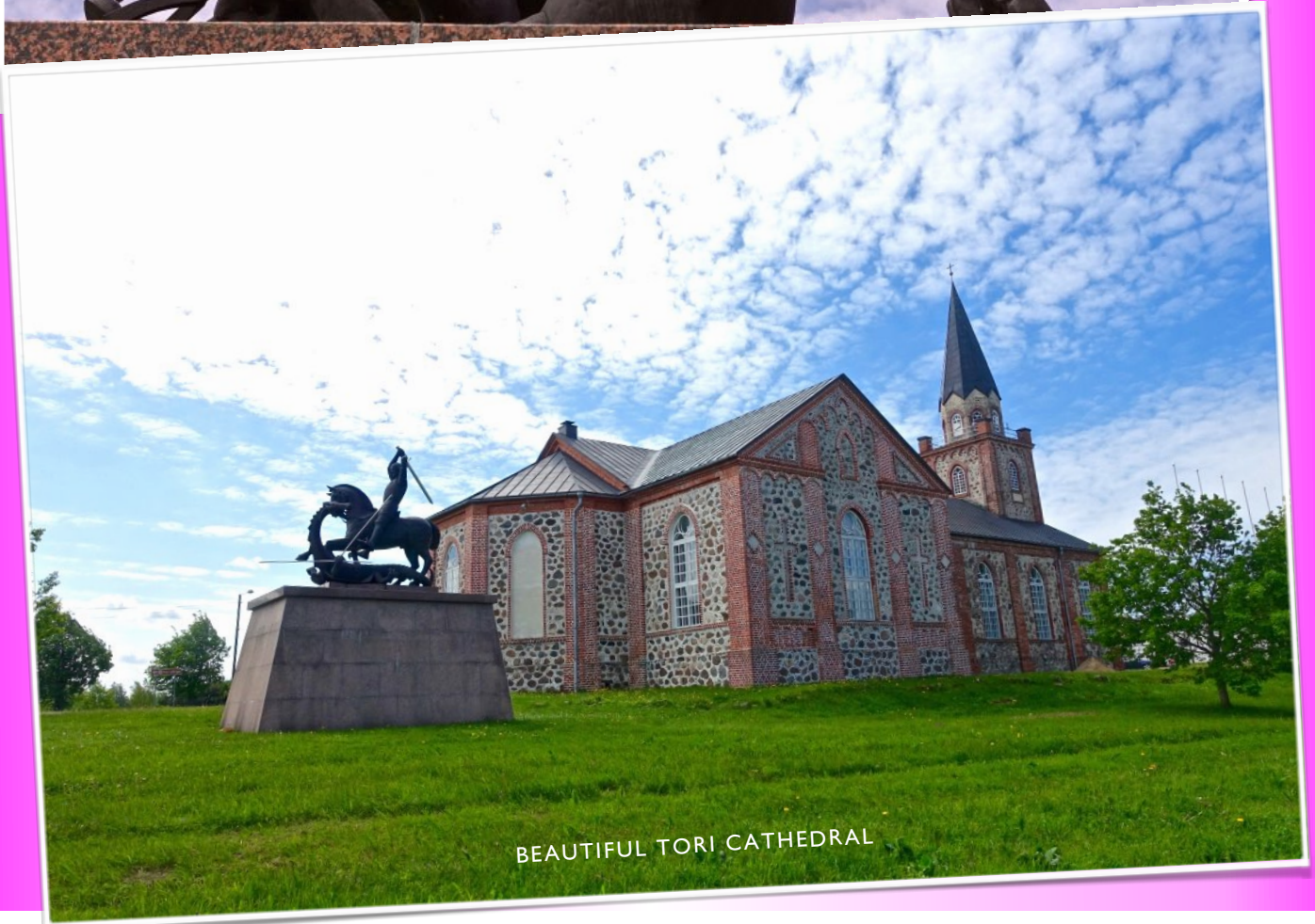
BEAUTIFUL TORI CATHEDRAL