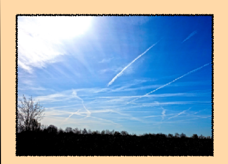
JET TRAILS You don't realise how busy the skies are. Very noticeable on a day with few clouds.