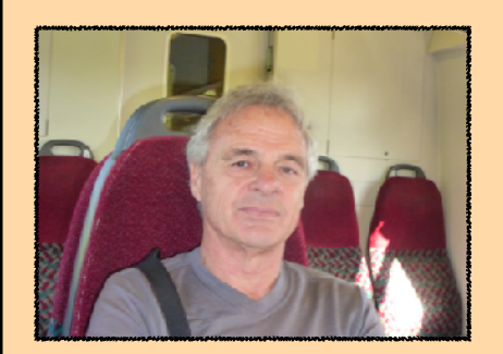
DRIVERLESS Quite a change from van driver to train passenger. Relax for a day before learning how to drive on the right.