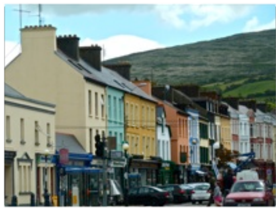
Typical peninsula village view