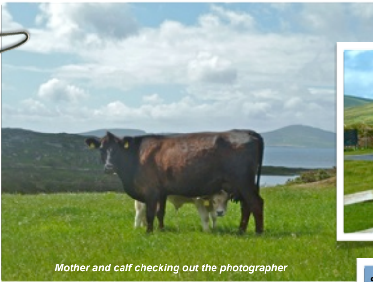
Mother and calf checking out the photographer