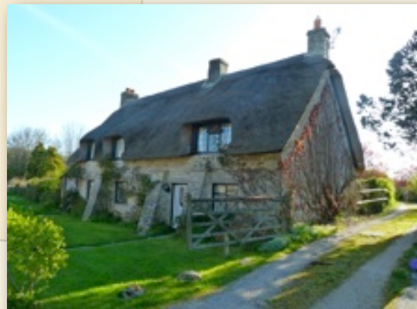
Beautiful but notice the buttresses holding the house up

The royal wedding mania is of course in full swing. Today, with our newspaper, we received a CD of Royal Wedding music to help us along our way! We will be in Scotland on the big day and I hope (I don't know about Sig), to spend it with the locals and experience some of the atmosphere. We (read that as I) intend to go to a local pub and just melt into the celebration -- that's if the Scots actually celebrate! Maybe they won't.