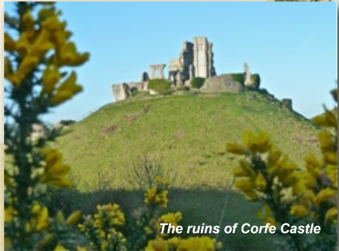
The ruins of Corfe Castle