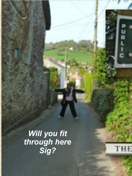
Will you fit through here Sig?

I'm surprised at the lack of facilities for bike riding. Walking and horse riding are catered for very well. Local paths over the paddocks (with stiles for negotiating fences and hedges) abound. Bridle paths for horses are also very common. However the humble biker needs to risk the very skinny roads or the even skinner footpaths that "sometimes" run alongside the roads. They don't give me much margin for error. If I get the wobbles up I am in trouble.