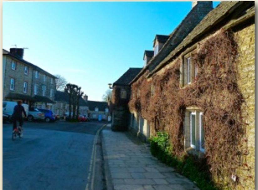
Wonderful old buildings but freezing cold hands biking in the morning

The supermarkets are pretty much as they are at home, but I have noticed some interesting things in relation to the fresh fruit and vegies. The source of oranges I bought yesterday was Morocco and the tomatoes and melon came from Spain. The cost of living does definitely appear to be lower than at home and we have enjoyed the pork pies and cornish pasties that abound in the deli section. Tonight we had some delicious Dorset pork sausages. I expected to find lots of local bakeries, but today was the first one I came across.