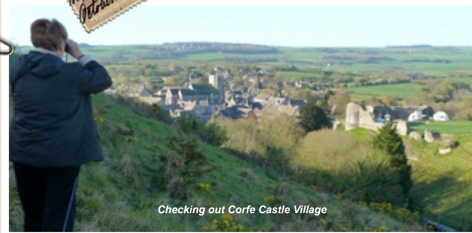
Checking out Corfe Castle Village