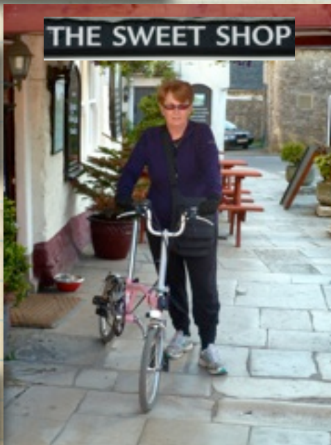
Jump on/up and bump your head