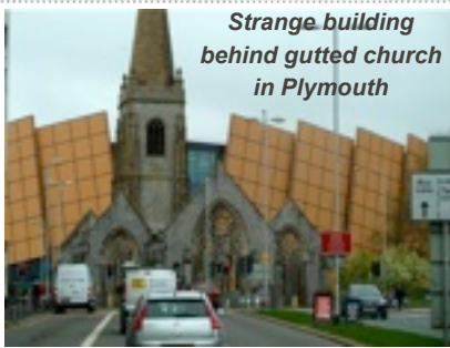
Strange building behind gutted church in Plymouth