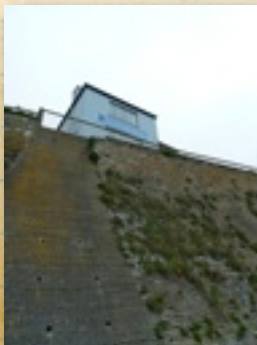
Height of the sea wall in Dowderry