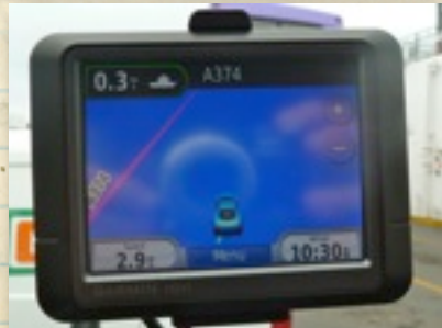
Ferry is part of the road in Plymouth - even the GPS knew that.