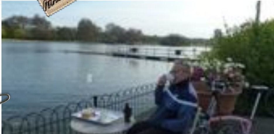
Breakfast by the Serpentine