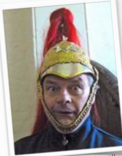
I'm not getting on a horse!!