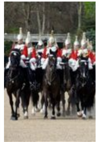
Royal Horse Guards