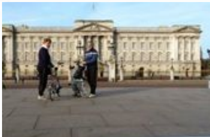
Buckingham Palace on bike