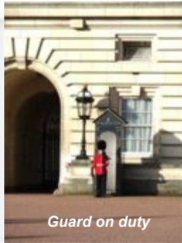
Guard on duty