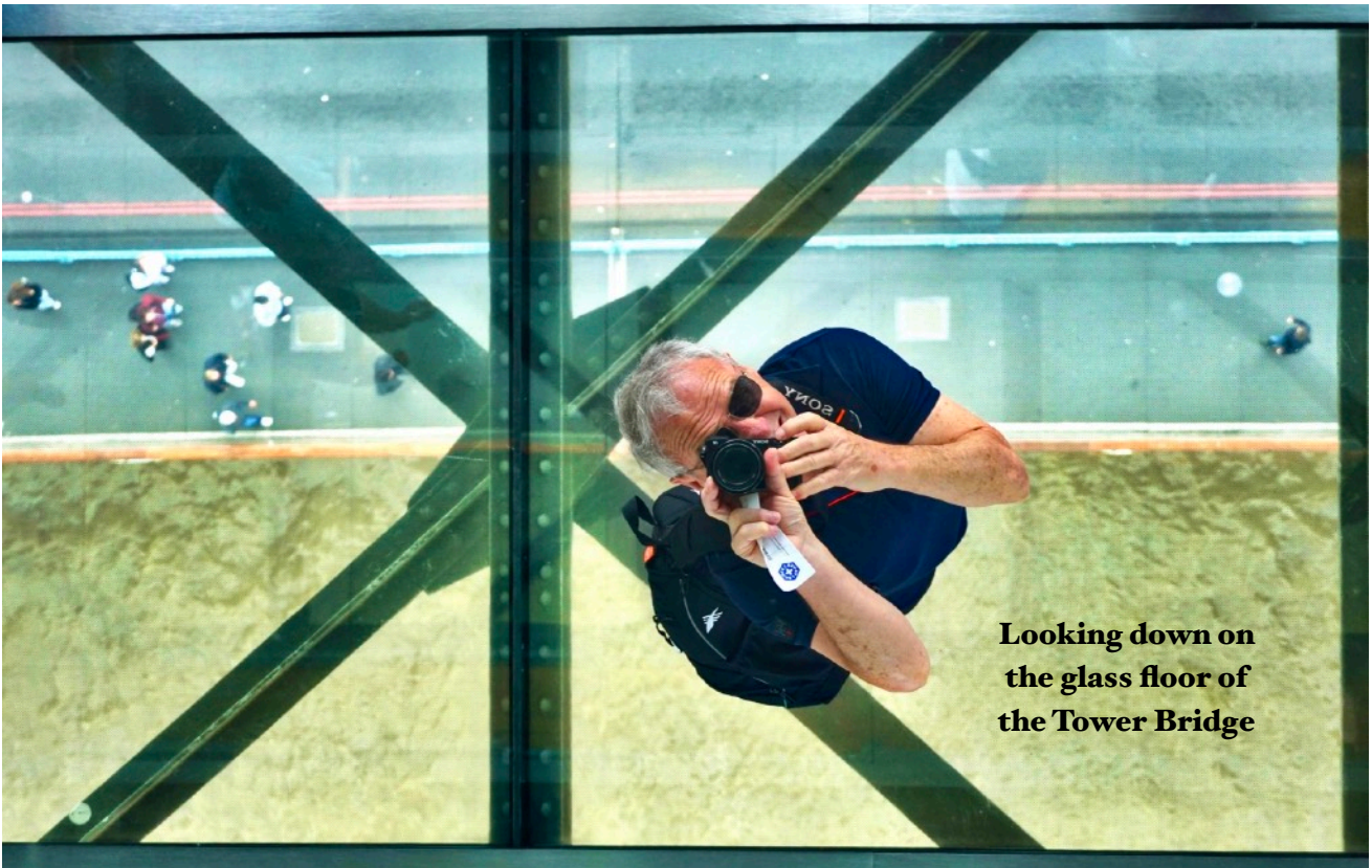
Looking down on the glass floor of the Tower Bridge