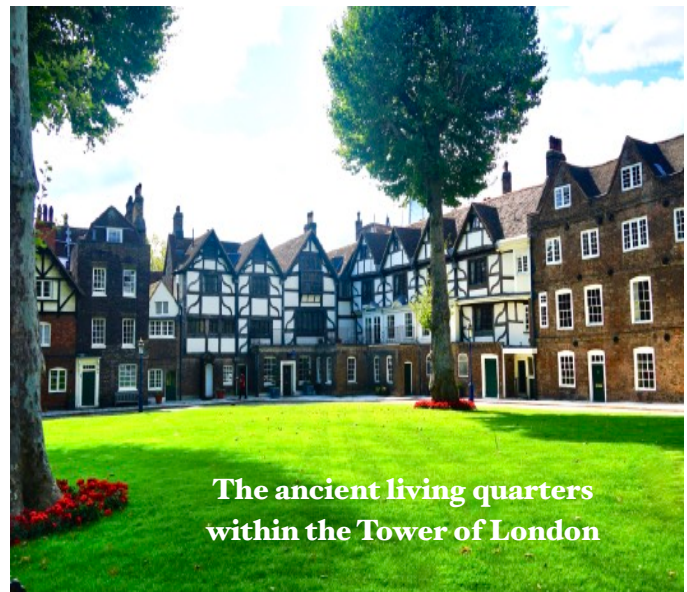
The ancient living quarters within the Tower of London