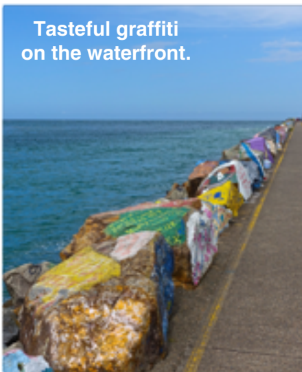
Tasteful graffiti on the waterfront.