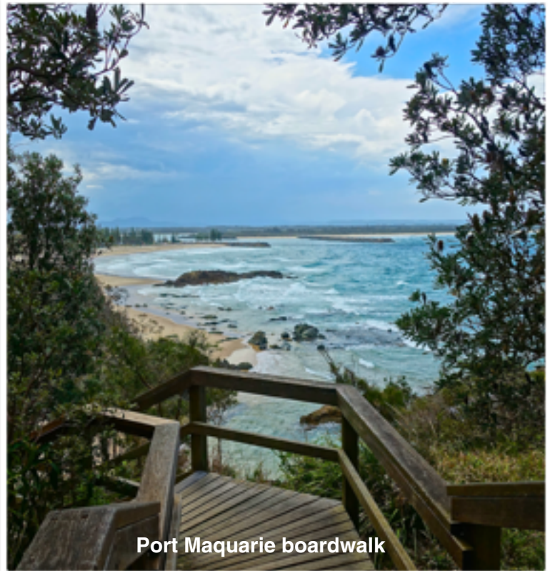
Port Maquarie boardwalk