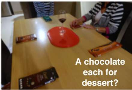
A chocolate each for dessert?