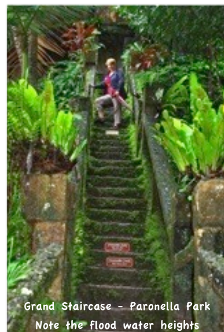
Grand Staircase - Paronella Park Note the flood water heights

José Paronella's dream was to build a castle. He chose a special part of Australia and created Paronella Park. On 5 Hectares beside Mena Creek Falls he singlehandedly built his castle, picnic area by the falls, tennis courts, bridges, a tunnel, and wrapped it up in an amazing range of 7,500 tropical plants and trees (now a lush rainforest!). It opened to the public in 1935 and was powered by a home built hydro electricity system! The system is still working to power this computer today. In its heyday it was the talk of the state. But gradually over time the estate fell into ruin. A number of devastating floods, a major fire and two recent cyclones caused considerable havoc but despite this tourists still come in droves to see and imagine its former glory. Gradually the ruins are being revitalized and the story of José Paronella's dream lives on.