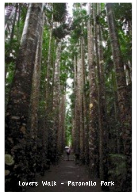
Lovers Walk - Paronella Park