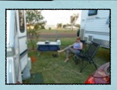
IRONY We are so lucky in Australia. Unlike in Europe and UK our toilets, BBQs and hot water are predominately free. Unlike Europe, the showers are not even time limited -- odd when you consider that we are the driest continent on earth

Most Australians know that total death toll of almost 1000 people. More than 40 ships were sunk or damaged. To the credit of our forces, the Japanese lost 130 aircraft. The government apparently down played the seriousness of the incursions, and quickly evacuated as many people as it could in anticipation of a Japanese invasion. Then, with the assistance of the Americans, a major building program was begun. The Americans played a much grater role than I ever knew.