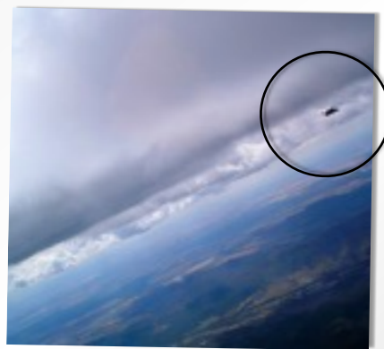
FLY LIKE AN EAGLE