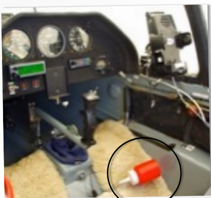
THE ALL IMPORTANT PISSAPHONE

When up in the air on a cloudless day pilots watch each other. When one pilot finds uplift the others quickly follow. Its called a gaggle. Sometimes the eagles show pilots how to fly. They also find updrafts of air. Once the glider is high enough the pilots set off for the next turn point and look carefully for more uplifts. Knowing where to look is a skill in itself. On this first day of competition there were 6 out-landings (pilots who did not land at the airfield). Chad had a good flight.