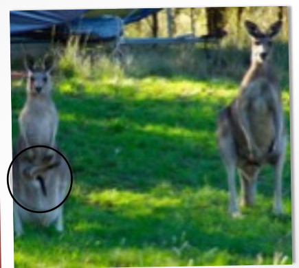
RENT A CROWD INCLUDES JOEY