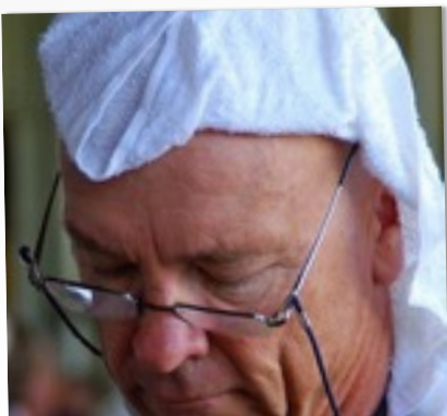
KEEPING A COOL HEAD

advantage. Some pilots would now be lost without these. But ultimately no matter how much information is at your finger tips the final decision is an individual one. A plan may be formulated in a pilot's mind but it's only when up in the air that a pilot can see, hear and feel the conditions to make those all important intuitive decisions - some of which will be disastrous, while others will be talked about for years to come. Making appropriate individual decisions for the conditions is what gliding is all about.