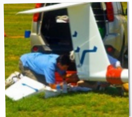
LAST MINUTE REPAIRS