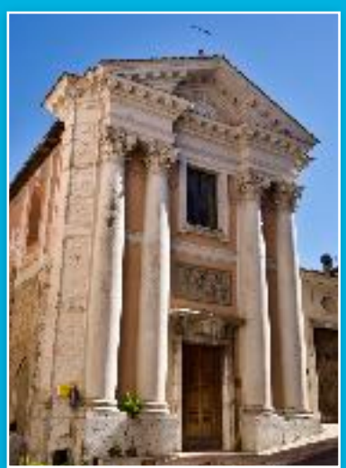
Italy has a long long illustrious history - and it shows. Around literally every corner you come across something that is seeped in history or a building that has a story to tell - assuming it's still standing.