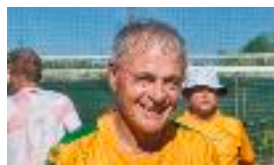
THAT LOOK OF EXHAUSTION ONE OF MANY