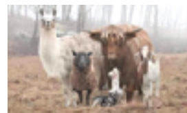
OVER 60S A GREAT GANG TO HANG OUT WITH