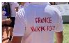
FRENCH CONNECTION ONE LEG ONLY