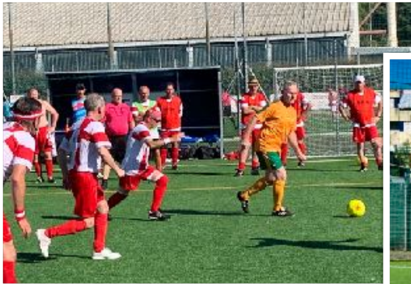
Small selection of snaps from today.