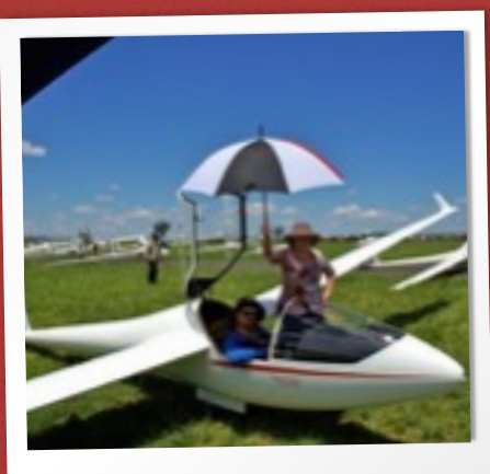
MISS SUNSHADE AT WORK

And finally all ground crew must be able to relax and enjoy both the quiet time when the glider is in the air and when a successful day is concluded. Ground crew must be able to deal with bullshit.