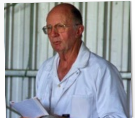
SAFETY OFFICER NO 1