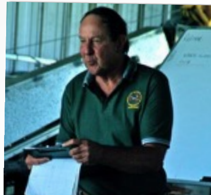
SAFETY OFFICER NO 2