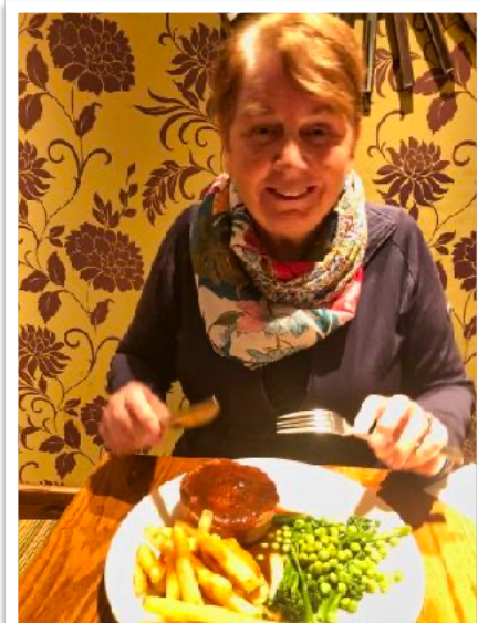
Pie with gravy - at last!