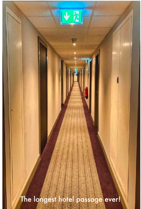
The longest hotel passage ever!