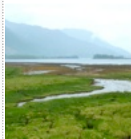
View from our van

Glencoe's history is well known - in 1692 the resident McDonald clan were virtually wiped out when 120 Campbell soldiers in the king's army spent 12 days living with the clan in Glencoe and then set about killing (37 in all) men, women and children early one morning. Some clan members did escape but 40 died later in the icy conditions.