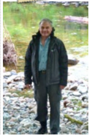
A warm happy chappy