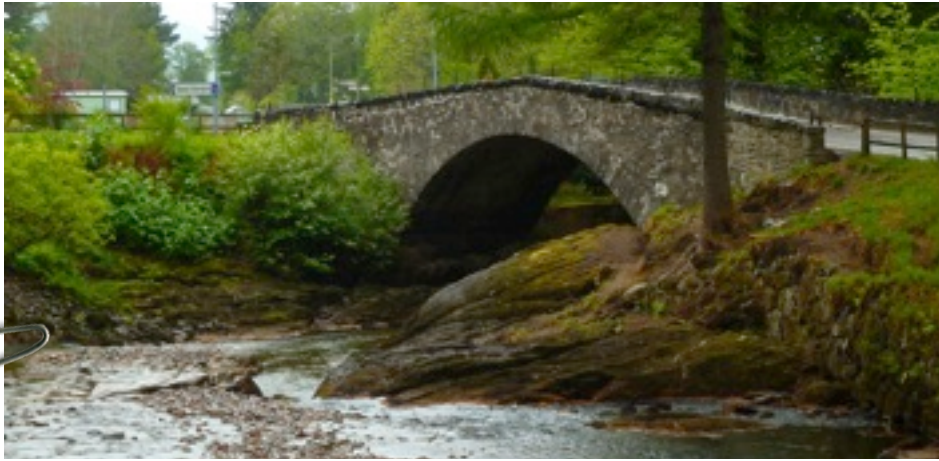
Lovely rural setting near Glencoe