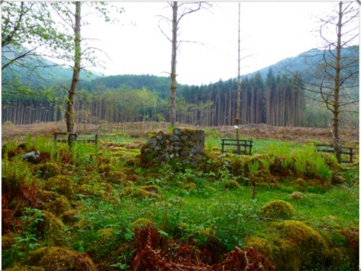
One of the sites of the Glencoe massacre. Most people would miss this site. It is tucked away on a walking track which we happened upon on our bikes.