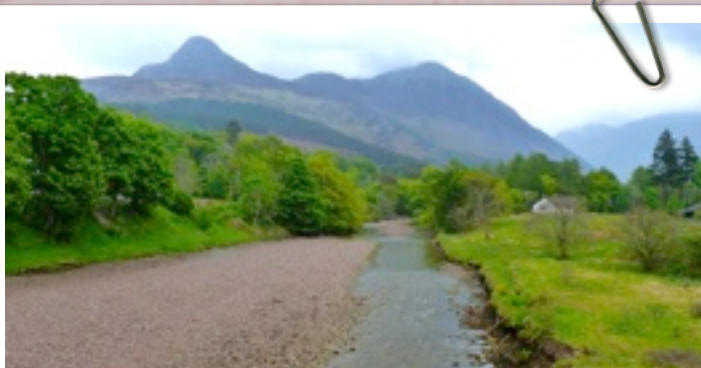
The camera does not do Glencoe's dramatic scenery justice.

Braving the weather we hopped on our bikes and rode around the village and out to rural parts. The cycle along the Coe river was very pleasant. Moss covered trees and rocks boarded a rock strewn river bed. We returned and decided to spend time enjoying the comfort of the van. Heaven. Tomorrow we intend to tour around the steeply sided area by van and visit the extensive visitor centre. After that who knows.