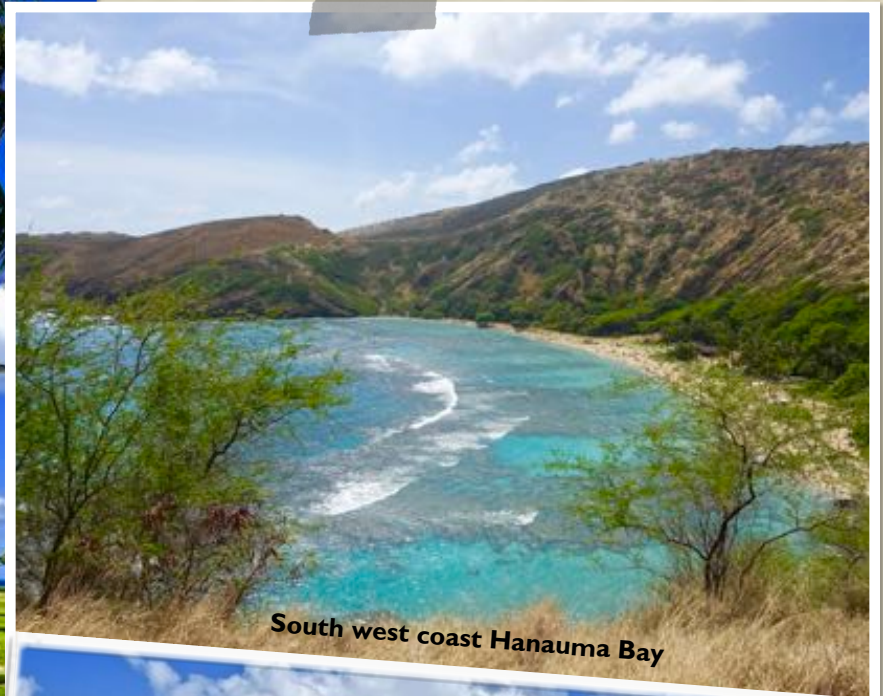
South west coast Hanauma Bay