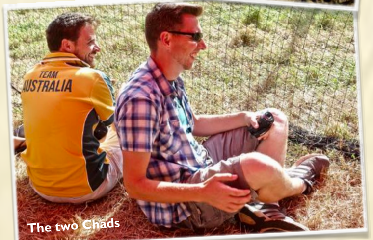
The two Chads