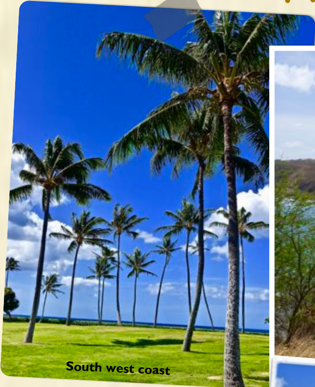
South west coast