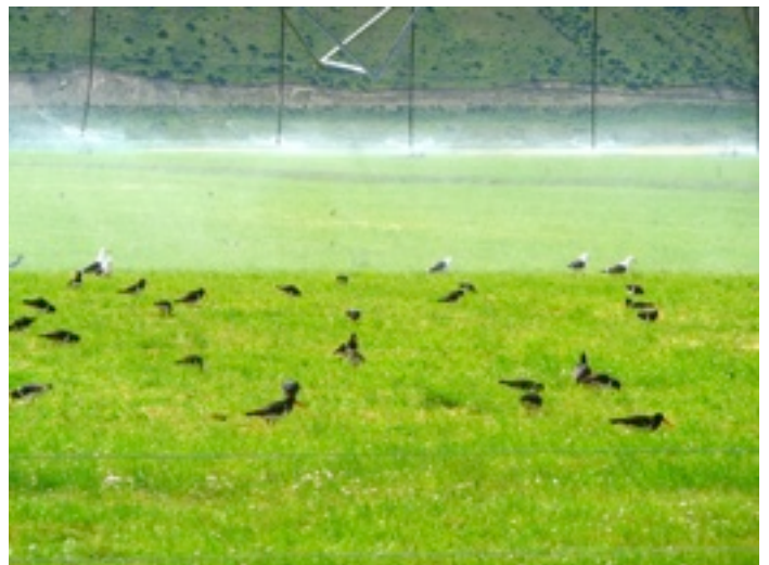
Birds under the big sprinklers