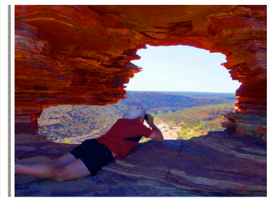
A HOLE IN THE ROCK