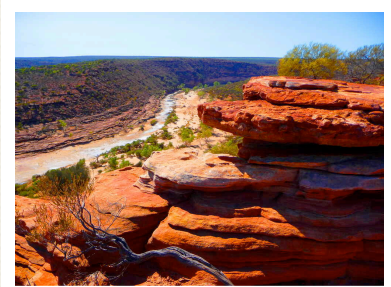
STUNNING RED ROCKS