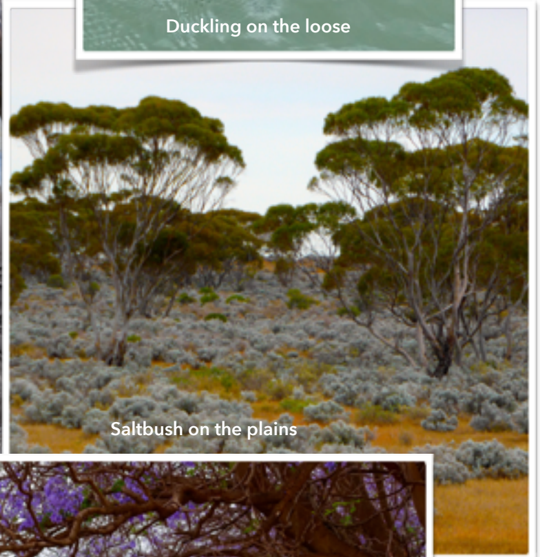
Saltbush on the plains