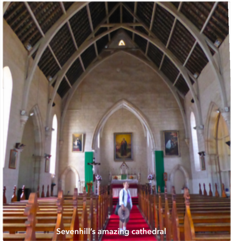
Sevenhill's amazing cathedral

After the Clare Valley we drove quickly on towards Mildura where we intended to take a couple of days rest. We stopped for a very pleasant overnight stay at Kapunda where we washed and cleaned our dusty van and car. The next day's drive to Mildura through Morgan gave us a surprise when the GPS announced "board ferry." Evidently its cheaper to run a ferry across the water than to build a bridge. The ferry crossing was part of the road, so - no toll. A lot of the countryside was salt bush and stubby trees. When we arrived at Mildura it was oppressively hot and not conducive to exercise of any sort. Instead we spent time lazing about, chatting with other campers in the camp swimming pool and then lolling about in air conditioned comfort in the nearby shopping centre. We even had time to get haircuts and catch up on past episodes of Game of Thrones and Outlander. And so it was then on to Swan Hill yesterday for a couple of nights. The river is right on our doorstep and the cooler day, after a rainy night, means we can get some bike riding in - and read about how hot the air is is in Brisbane with the G20 summit.