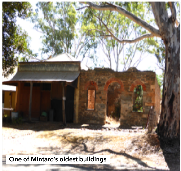
One of Mintaro's oldest buildings