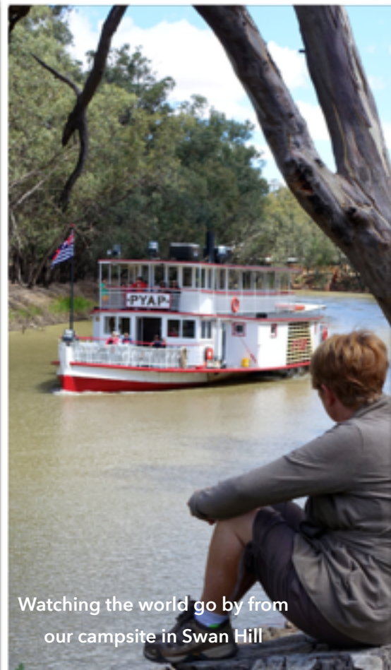
Watching the world go by from our campsite in Swan Hill