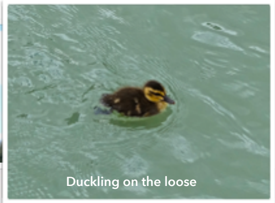
Duckling on the loose