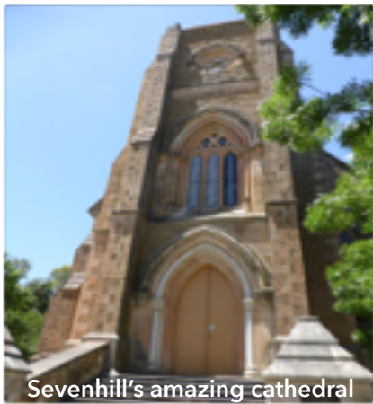
Sevenhill's amazing cathedral