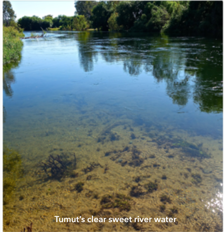
Tumut's clear sweet river water