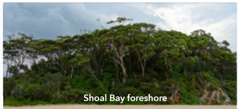
Shoal Bay foreshore