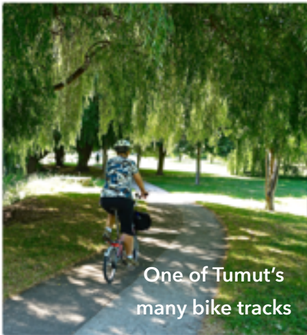
One of Tumut's many bike tracks