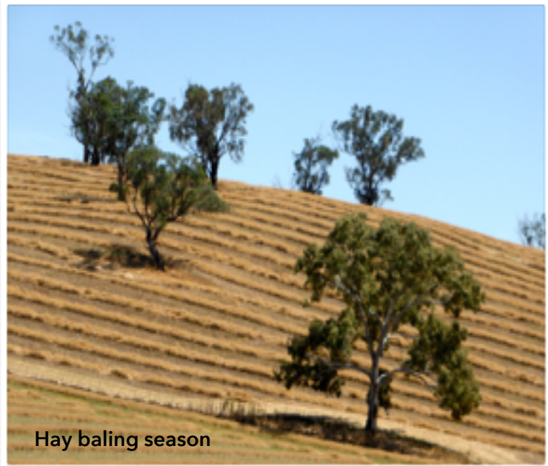
Hay baling season