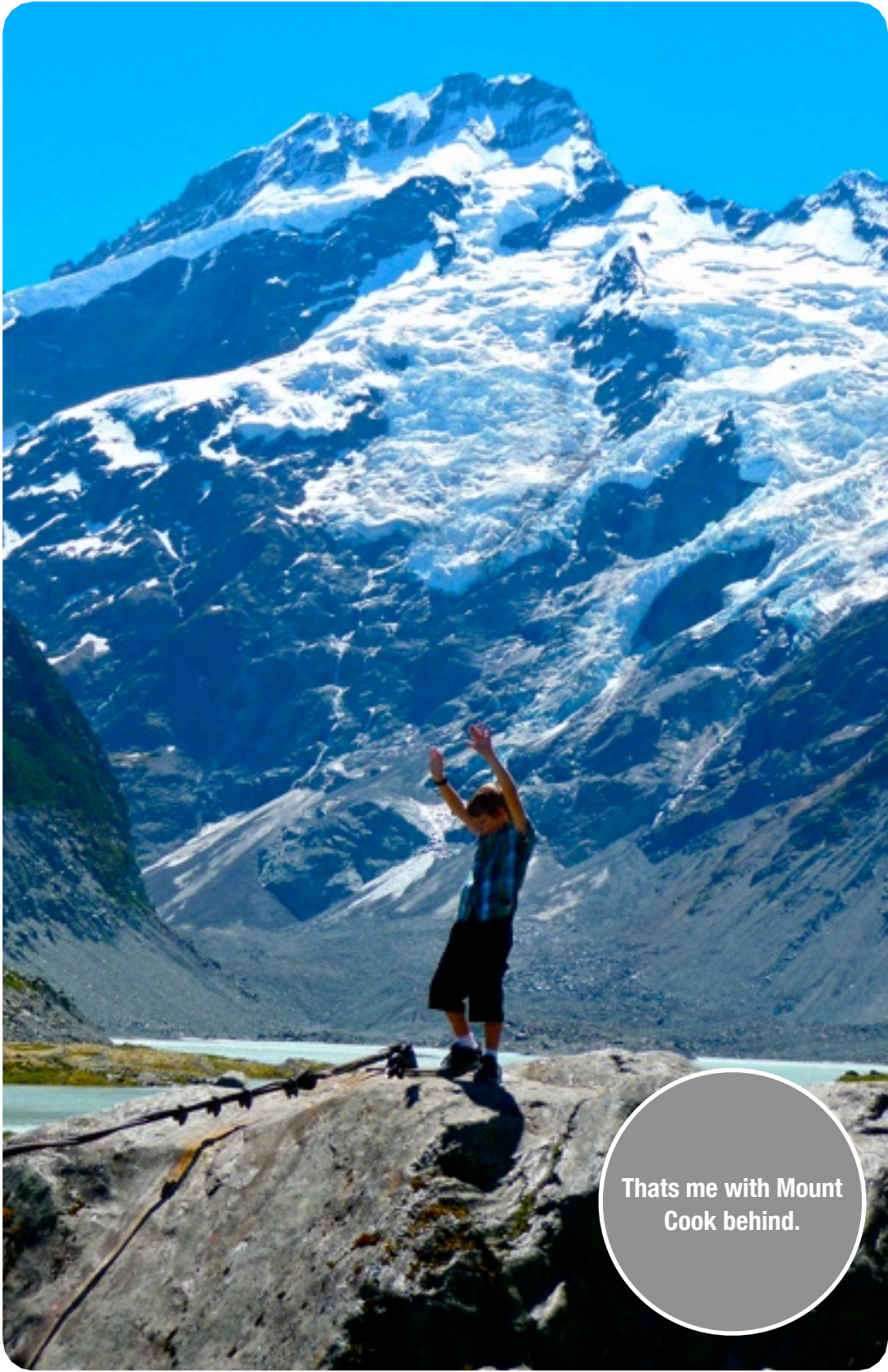
Thats me with Mount Cook behind.