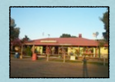
BURKE & WILLS ROADHOUSE This is the epitome of the true Outback roadhouse. A rough and ready pitstop. A place where truckies stop to eat and quench their thirst, and a paddock where we could leave our van.