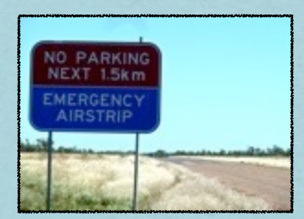
AMAZING We came across this sign yesterday. It is probably used by the flying doctors. We kept our eyes skyward as we drove along.