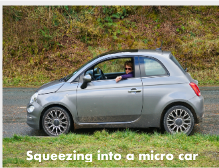
Squeezing into a micro car

4 months | 6 countries | 8 house swaps | 10 journey legs