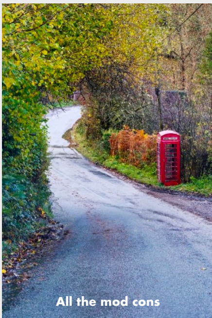
All the mod cons