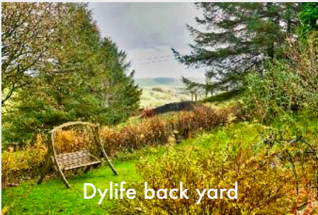
Dylife back yard