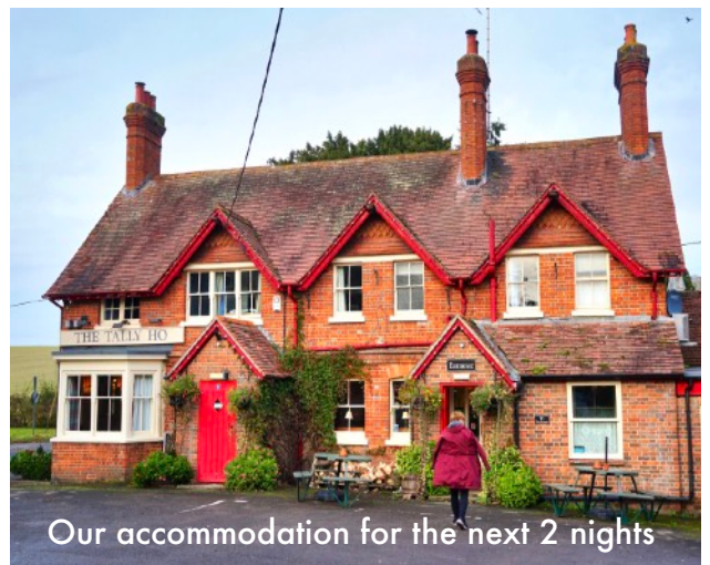
Our accommodation for the next 2 nights