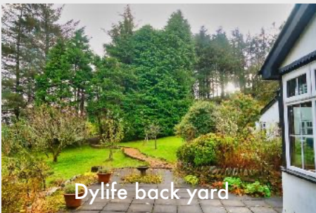
Dylife back yard