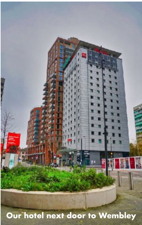
Our hotel next door to Wembley