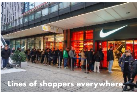
Lines of shoppers everywhere