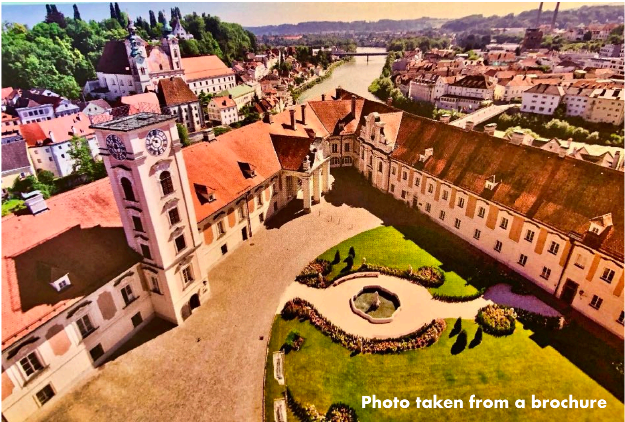
Photo taken from a brochure