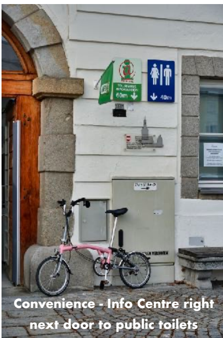
Convenience - Info Centre right next door to public toilets