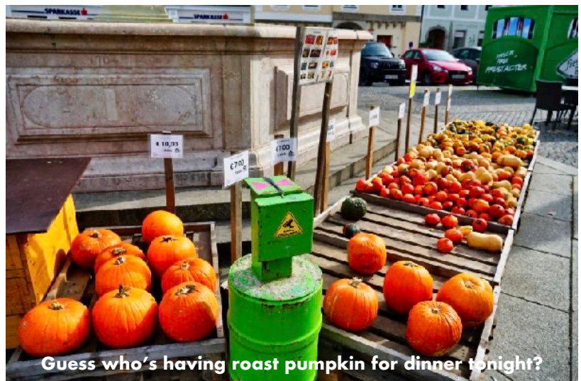
Guess who's having roast pumpkin for dinner tonight?