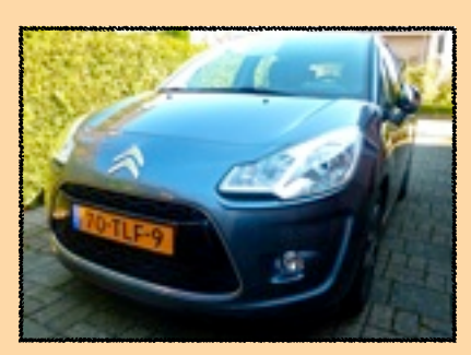
CLEVER CAR Our eco Peugeot C3 engine automatically stops running when we stop at the lights to conserve fuel. Heather still can't work out how it can do that.