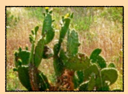
PRICKLY PEAR Someone should tell the Italians that Australia beat this cactus menace with a moth called cactoblastis. Heather pointed out that Italians might actually like the plant - so leave it to them to decide.