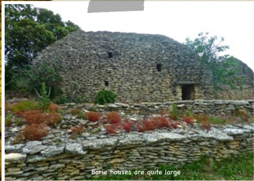
Borie houses are quite large