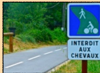
BIKE ROAD Paradise for bike riders who don't want to mix it with cars. This very long bike path is one of many dedicated bike tracks in the local area. This one runs for over 60 kms along an old disused railway line.