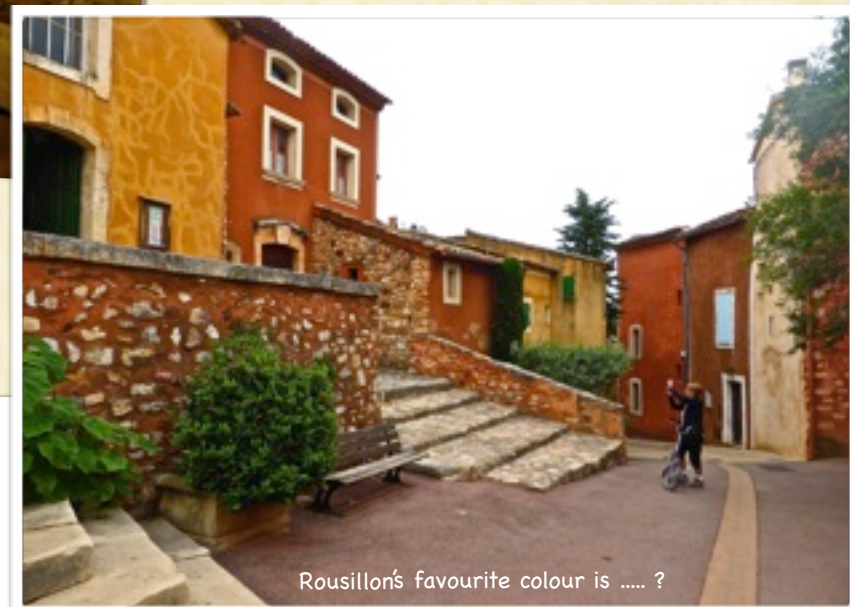
Rousillon's favourite colour is ..... ?