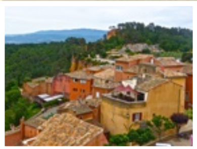
RED OCHRE HOUSES