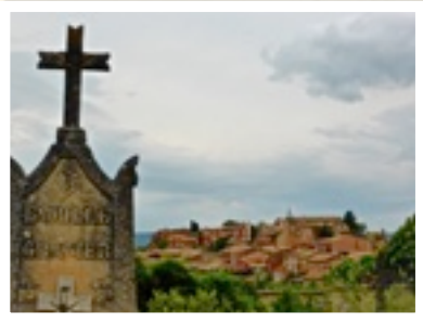
RED OCHRE CEMETERY