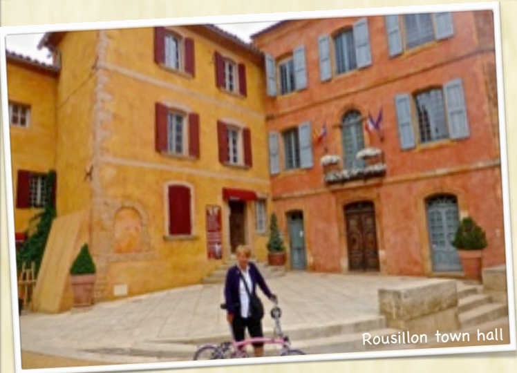
Rousillon town hall