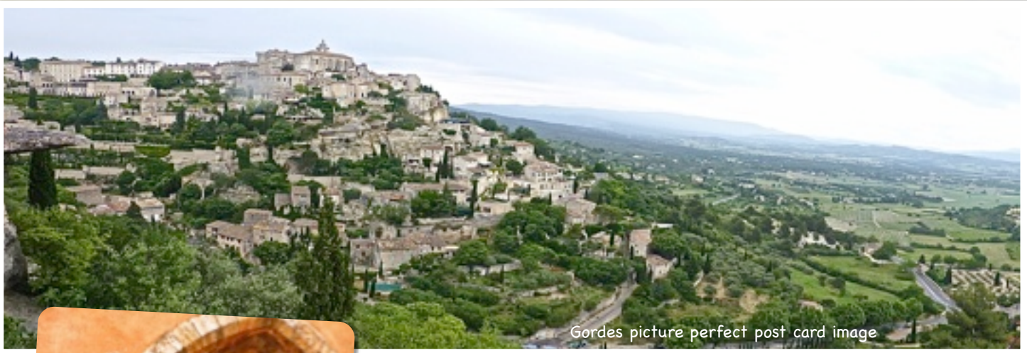
Gordes picture perfect post card image