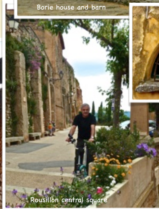
Rousillon central square