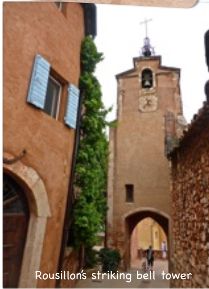
Rousillon's striking bell tower