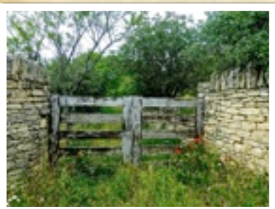
A GORDES BACK STREET