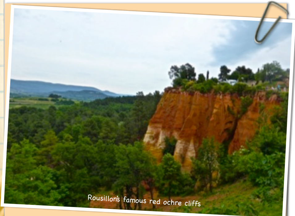
Rousillon's famous red ochre cliffs