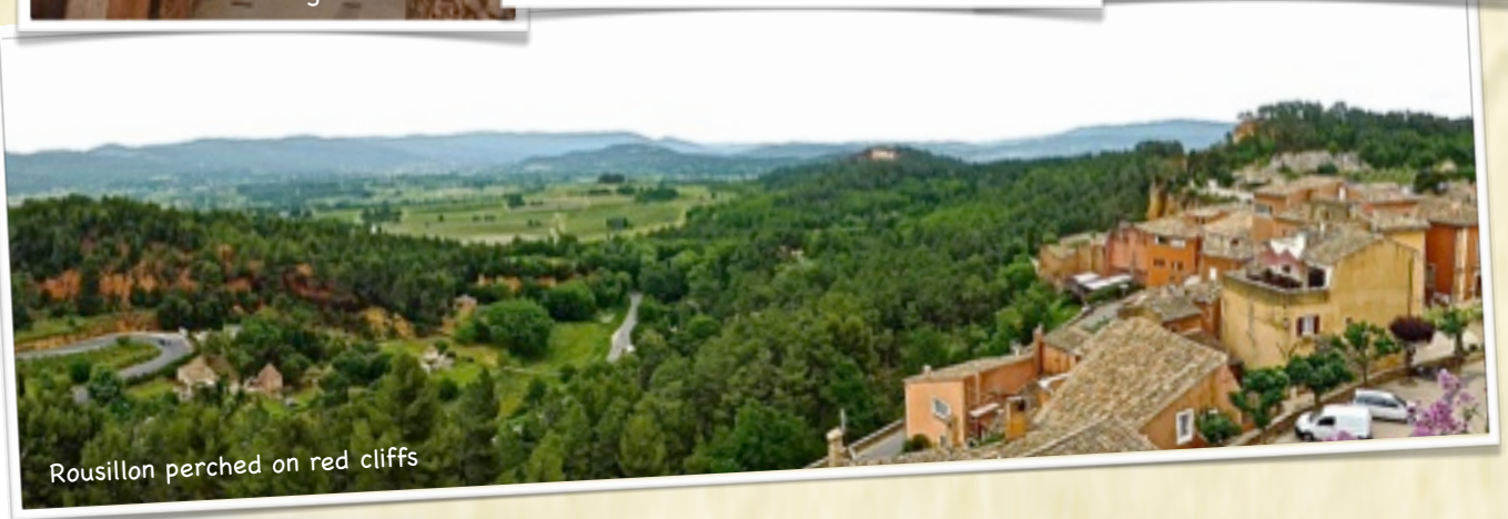
Rousillon perched on red cliffs