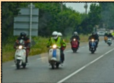
JUNIOR HELLS ANGELS? Came across a huge cavalcade of motor scooters. Made a change from the black leather-clad bikie groups we found in Corsica. Wondered what motor scooter convention they were going to?