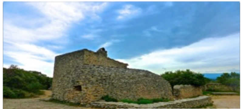
Borie house and barn