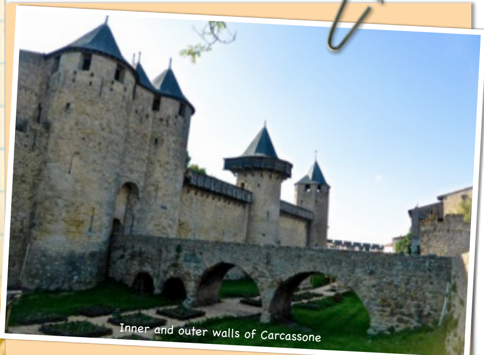
Inner and outer walls of Carcassonne

We have not really done much homework as to where we intend to go next. We are keeping an eye on the weather after other campers have told us of the bad conditions in central Europe. We have had excellent weather to date and don't want to spoil this.