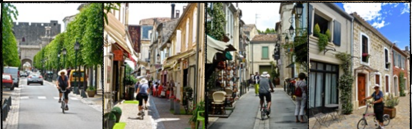
The quaint streets of Aigues Mortes

We are glad not to be here in school holidays.