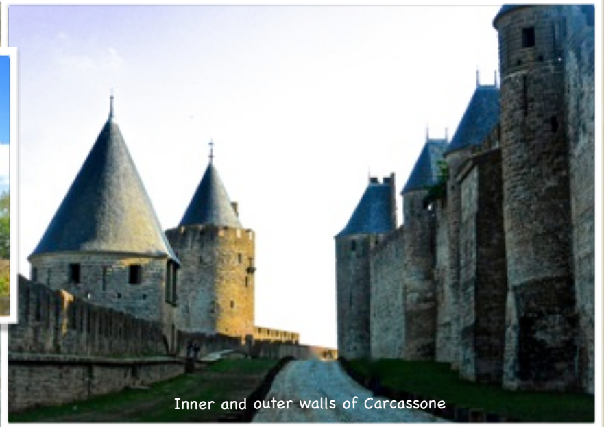
Inner and outer walls of Carcassonne