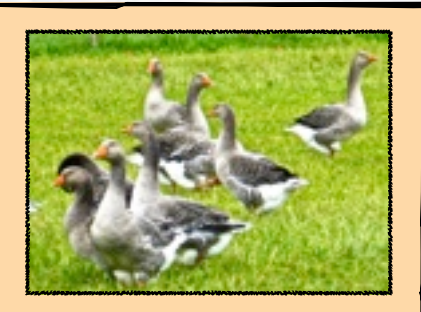
FAT GEESE We wondered why there were hundreds of geese in a farm paddock. We read later about the French practice of force feeding these animals to make them rich with fat. Their fat livers are considered a delicacy.