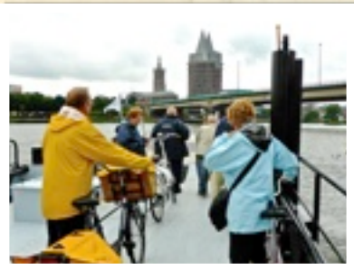
HEATHER PLUS POSTIE