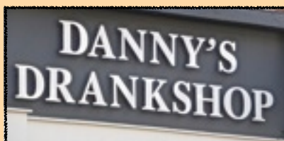
ALCOHOL ANYONE? Only the Dutch could call their bottle shops - "Drankshop".