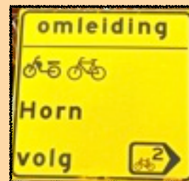
BIKE HEAVEN Such a novelty to us to see bikes accorded so much effort. Their own highways, their own ferries, their own set of traffic lights and motorists who give them due respect.