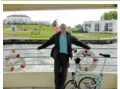
ENJOYING THE FERRY RIDE