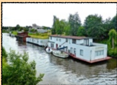
HOUSE BOAT This one really looked like a "house" boat!! Three stories, all mod cons with a nice car, runabout boat and luxury yacht parked/moored outside.