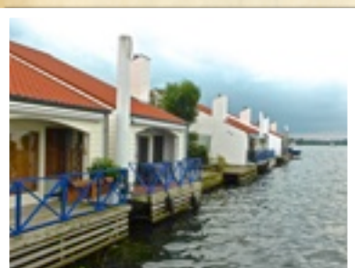
ROW OF FLOATING HOUSES