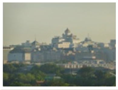
BEIJING CITY CENTRAL