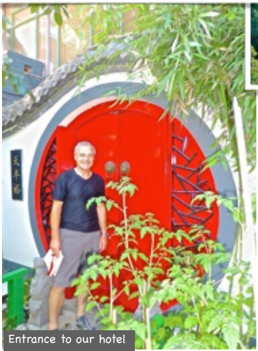
Entrance to our hotel