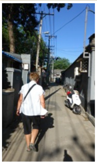
HOTEL ENTRANCE STREET

On the advice of George (our House Swap host) we had booked online a room at Schiphol Airport at a hotel called Citizen M. As the name suggests it has a funky, futuristic atmosphere. The check-in procedure was totally done via computer and the lobby decor was ultra modern black and red. This place is very minimalist.