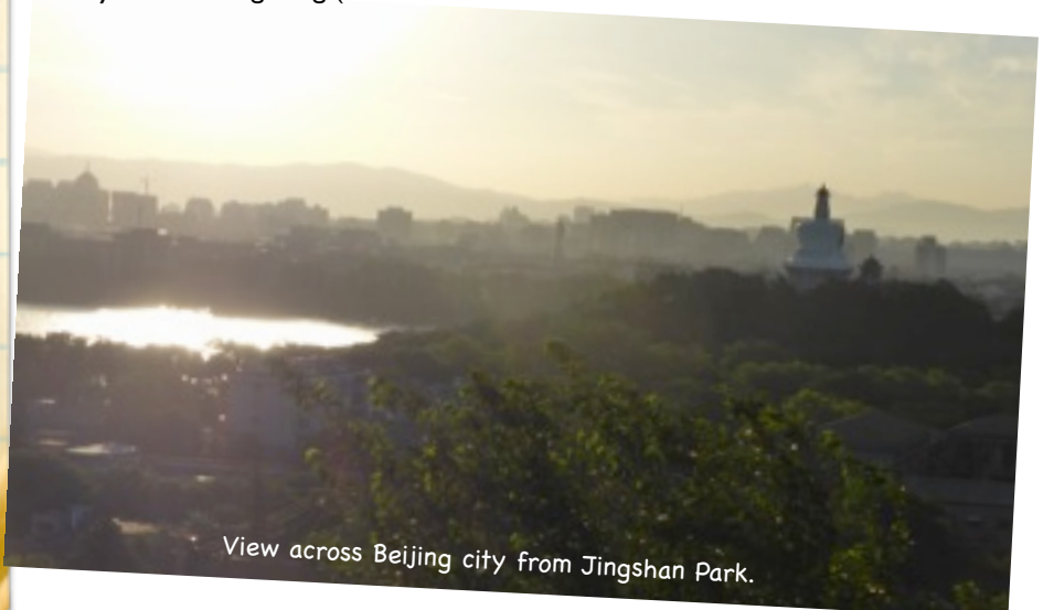
View across Beijing city from Jingshan Park.

Tomorrow we are off on a tour to the Great Wall. We booked and paid for that at home. We paid too much according to the hong tong manager but we don't care really. It is a private guide and hopefully will be enjoyable.