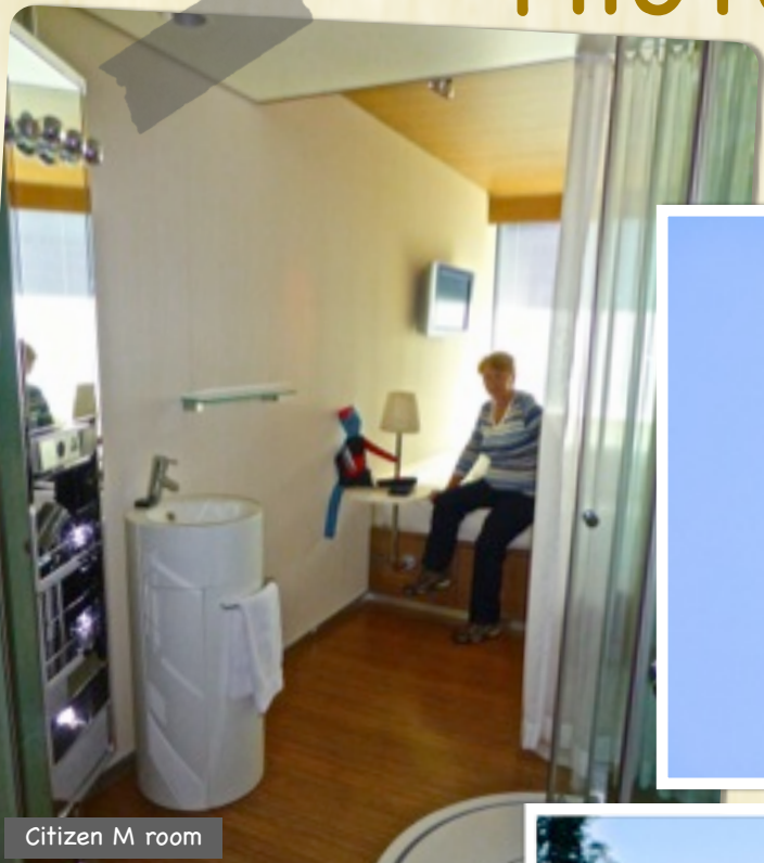
Citizen M room