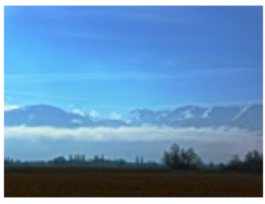
OUR VIEW FROM CAMP