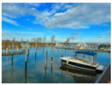
NEXT TO OUR CAMP