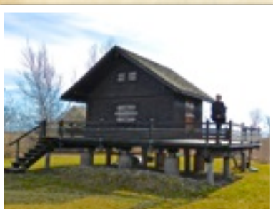
HIGH & DRY SUMMER HOUSE