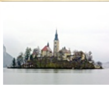
JUST ONE LAST PHOTO OF BLEDS' BEAUTIFUL ISLAND (TILL TOMORROW)

Bled may have lots of things to offer but we think they're probably best experienced in sunny weather.