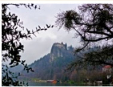
CASTLE ON THE HILL