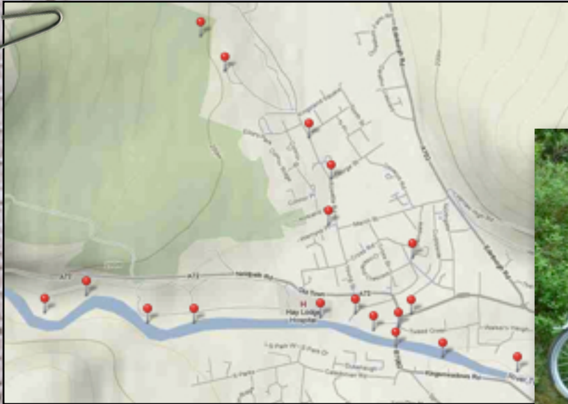
Our camera with inbuilt GPS shows where we took photos