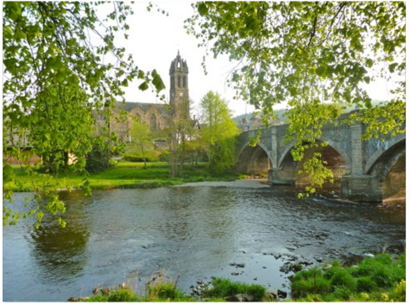
So many villages have charm like Peebles - bubbling brook, cathedral with spire and peace and quiet