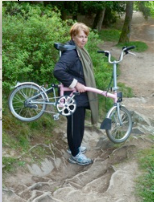
The bike is light to carry with seat hooked over the shoulder